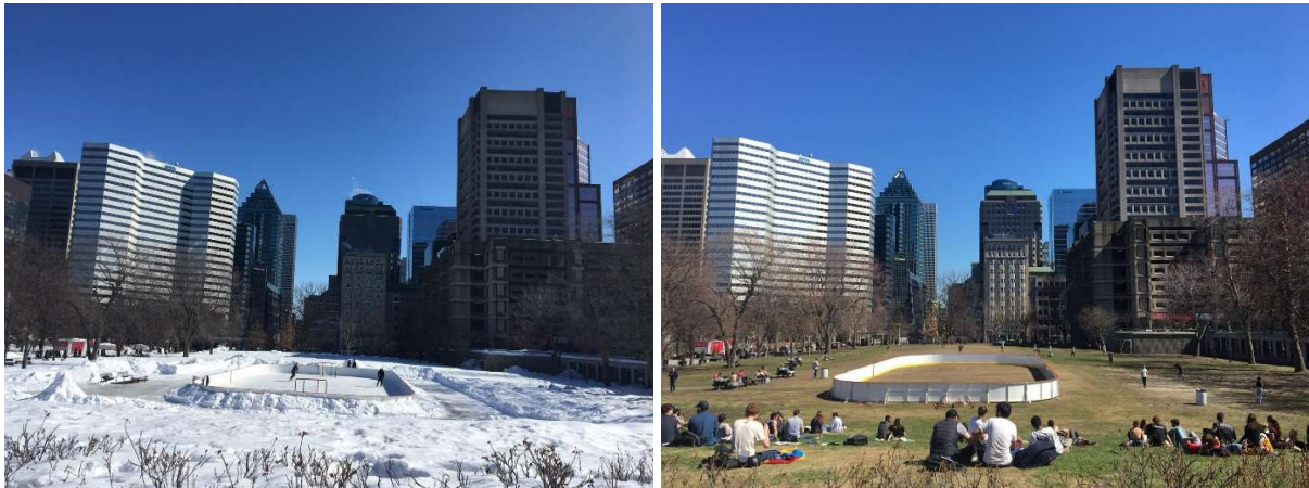
campus views - with and without snow

I really enjoyed the variety of clubs and volunteering opportunities offered by McGill. As an extracurricular activity I participated in a program called „Homework Zone“ where we went to a school in an under-served neighborhood every Wednesday for two hours. As a mentor I worked with the same mentee every week and I both helped her with her homework and did „creative challenges“ that focused on building relationships and creativity. In addition to that, I participated in a program called „Spaghetti Nights“ where students go to the „Homework Zone“-schools to offer workshops for the parents (e.g. about healthy meals, bullying,...). Before the workshops, we had dinner with the families and during the workshops we looked after the children. It was a great, enriching experience and I really enjoyed having the opportunity to participate in both of these amazing programs!